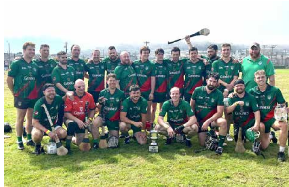
Cleveland Saints - 2024 U.S. Jr. C National Hurling Champions

Go raibh míle maith agaibh Thanks y'all, to our readers and supporters. We need your help and involvement, but would most like to share the fun of Irish sport and Cleveland community with you. Consider getting involved at